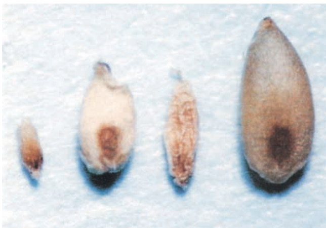
Fig. 1. Classes of switchgrass caryopsis development from a tetraploid by tetraploid cross. From left to right: unfertilized ovary; small caryopsis with limited endosperm development, i.e., endosperm is small and has a floury appearance; small caryopsis generally brownish in color with shriveled endosperm; and normal caryopsis. Magnification \times 26 .

spectively. These percentages are very similar to those reported by Talbert et al. (1983) and Taliaferro and Hopkins (1996) and together they demonstrate that switchgrass is a highly self-incompatible species.